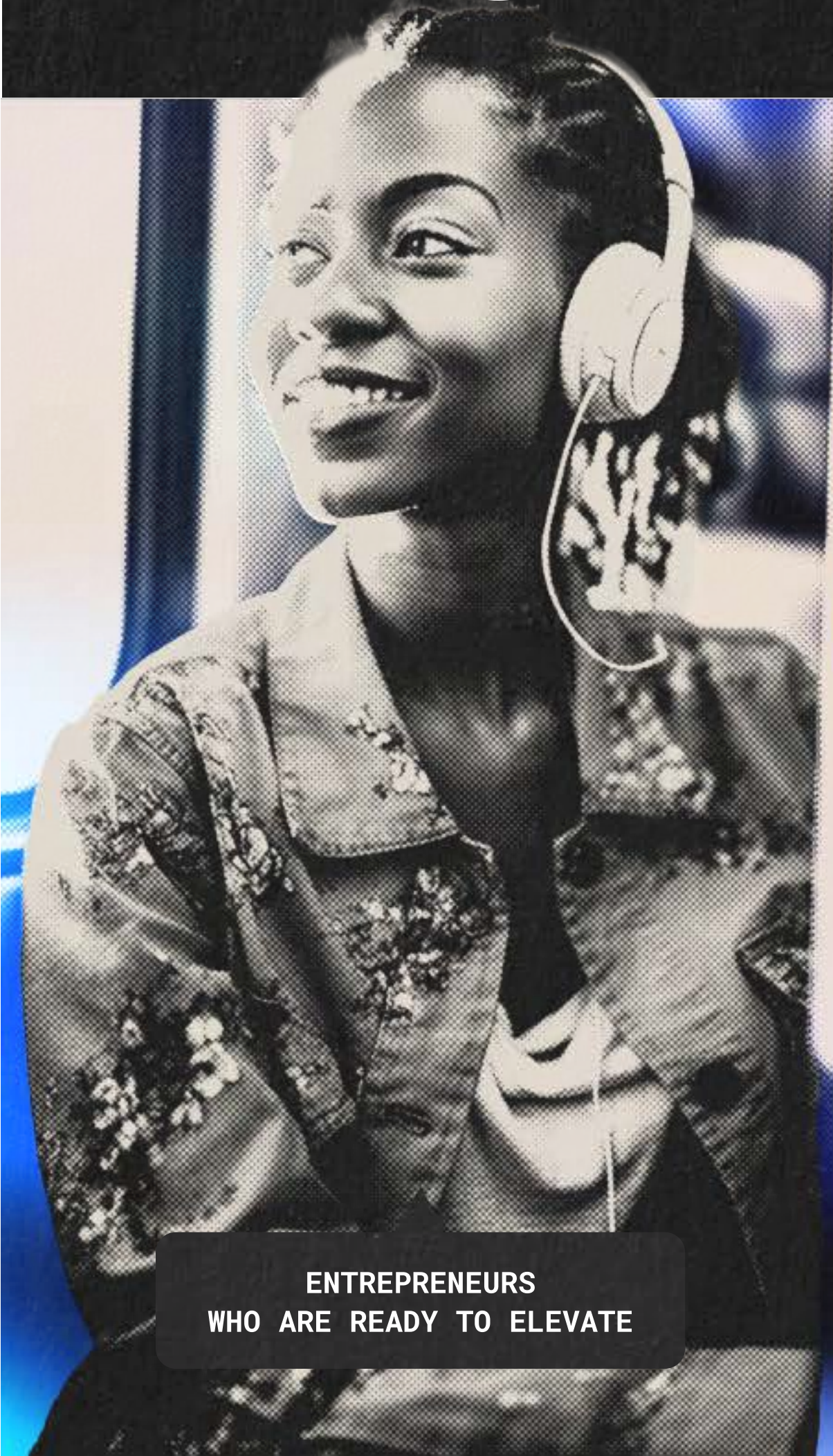
ENTREPRENEURS WHO ARE READY TO ELEVATE