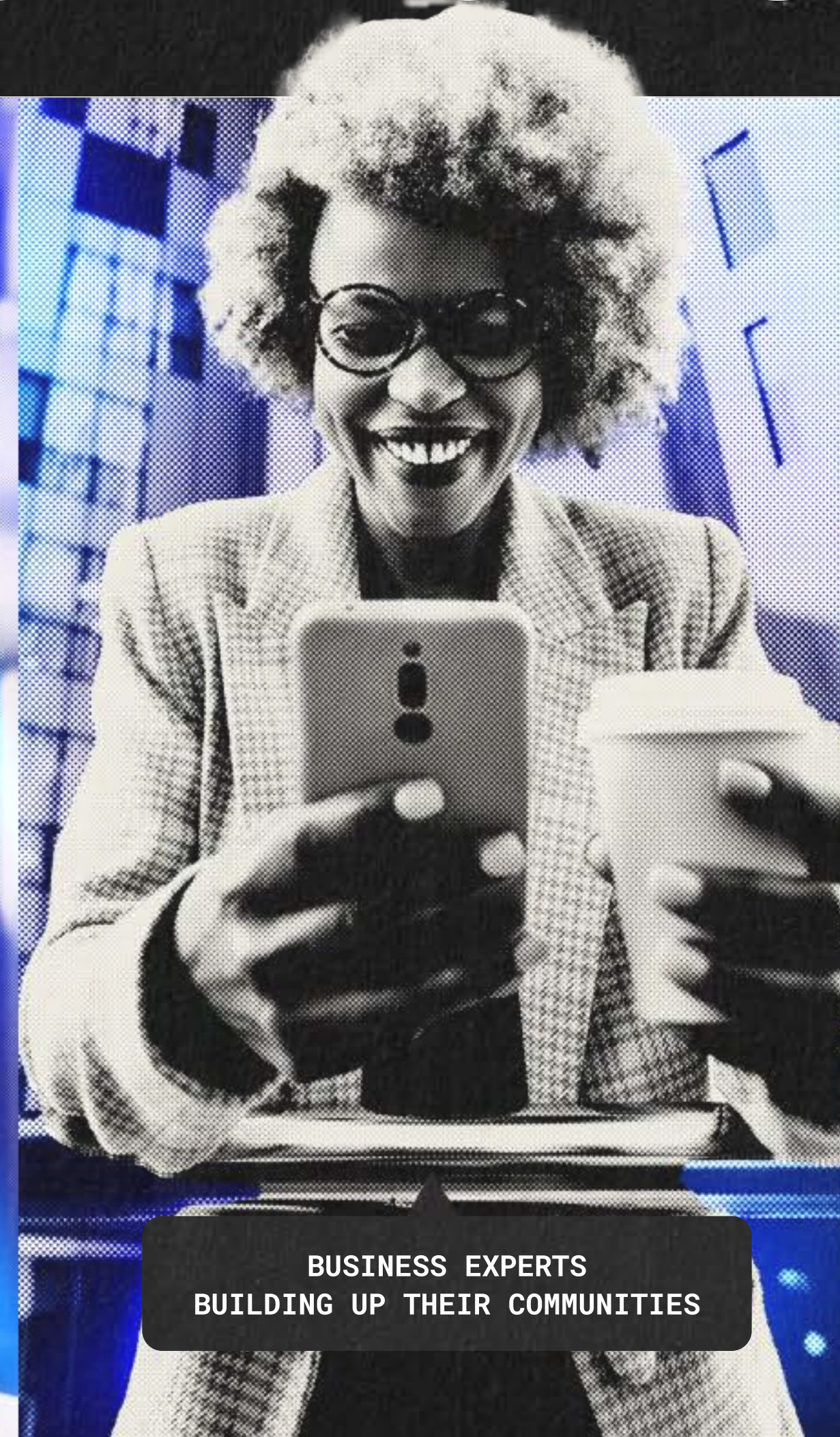
BUSINESS EXPERTS BUILDING UP THEIR COMMUNITIES